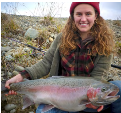
Gladius® Canal Classic