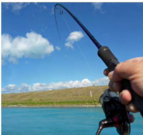
Gladius® Canal Classic