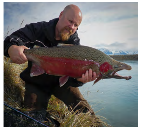
Gladius® Canal Classic